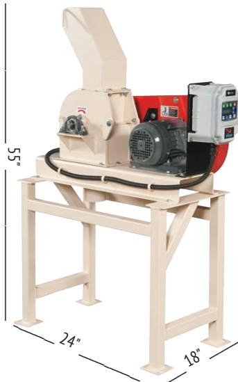
True laboratory scale hammer mill, weighing 225 lbs (100kg).