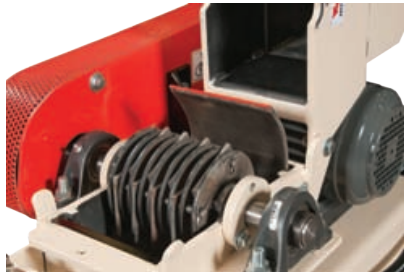
9" rotor diameter features option of swinging or fixed mounted hammers.